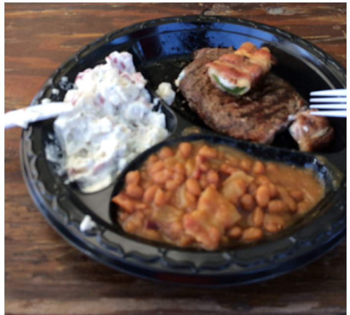
Steak and Armadillo Eggs for the Crawfish Festival

Free Consultations, Award Winning Services, and Satisfaction Guaranteed!