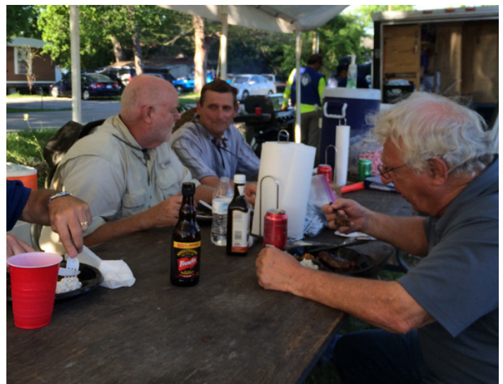
Crawfish Festival 2016

Special Thanks to the Kitchen Staff and our cooking knights who showed up and treated us to Steaks, Gumbo, Bacon Hamburgers and all kinds of good food for our last two events. Whether or not it makes us look good as a council, it makes us feel good. THANKS GUYS!