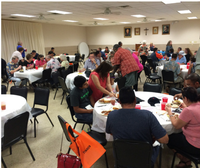
Bowling League Appreciation Dinner